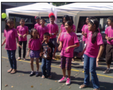
Holy Family Parish students in San Andres Bukid