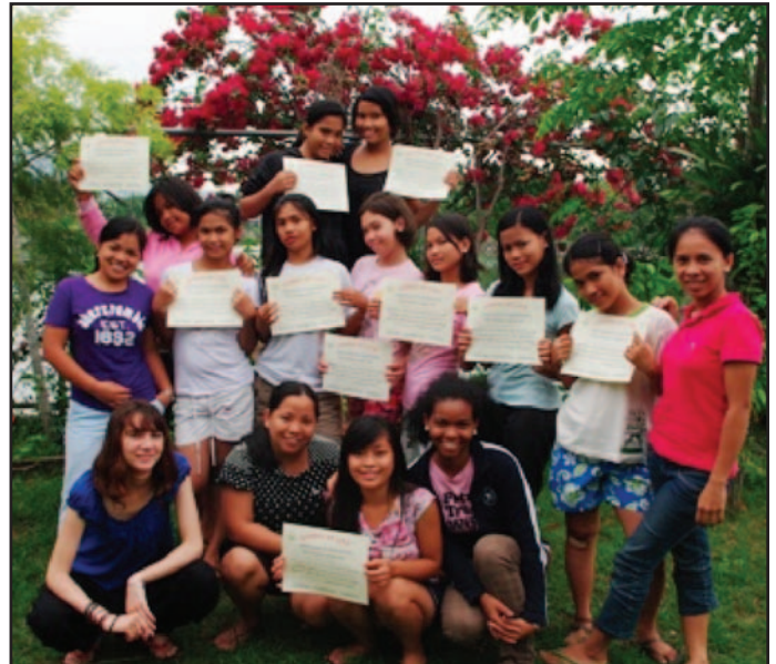
ACAY's "School for Life" girls

PIA renewed a grant of $5,000 for 13 bright but poor students for the coming school year; 12 are in college and 1 in high school. ■